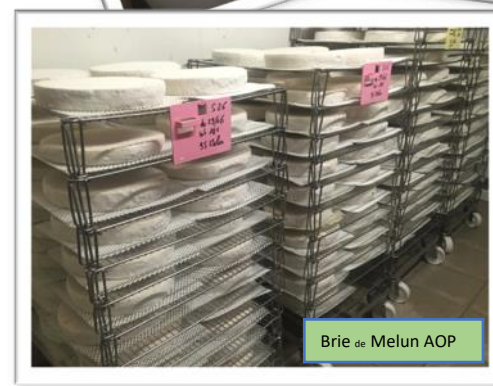
Brie de Melun AOP